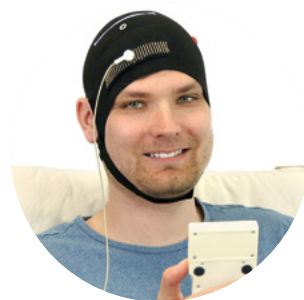
Direct current stimulation with electrode cap

neurocare group AG Rindermarkt 7 80331 munich, Germany neurocaregroup.com