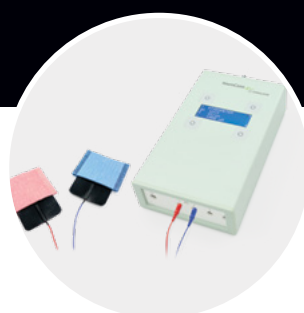
DC-STIMULATOR with rubber electrodes and sponges

p 1300 934 947 f 1300 734 712 w www.symbioticdevices.com.au e team@symbioticdevices.com.au a Unit 6, 105-111 Ricketts Road Mount Waverley, VIC 3149