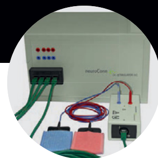
4/8 (optional 16) freely programmable channels