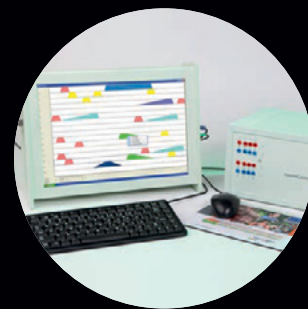
DC-STIMULATOR MC with medical panel PC