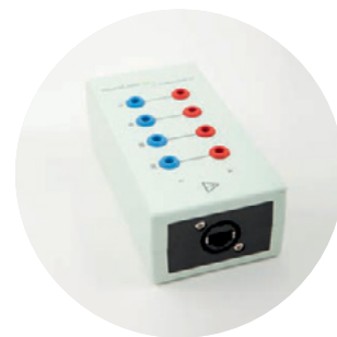
Adaptor box for 4 x 4 / 8 x 8 or 4 x 1 / 8 x 2 stimulations