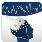
EEG & Brain Stimulation

Slim profile for close coil positioning; active electrodes for shortest recovery after artifacts